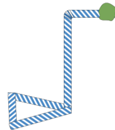
Putting extra weight at the top makes the structure unstable .